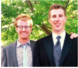
Random 20 th century young adults.